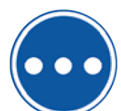
Many other applications