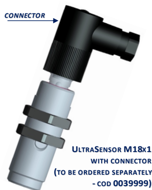
1655326 ULTRASENSOR M18x1